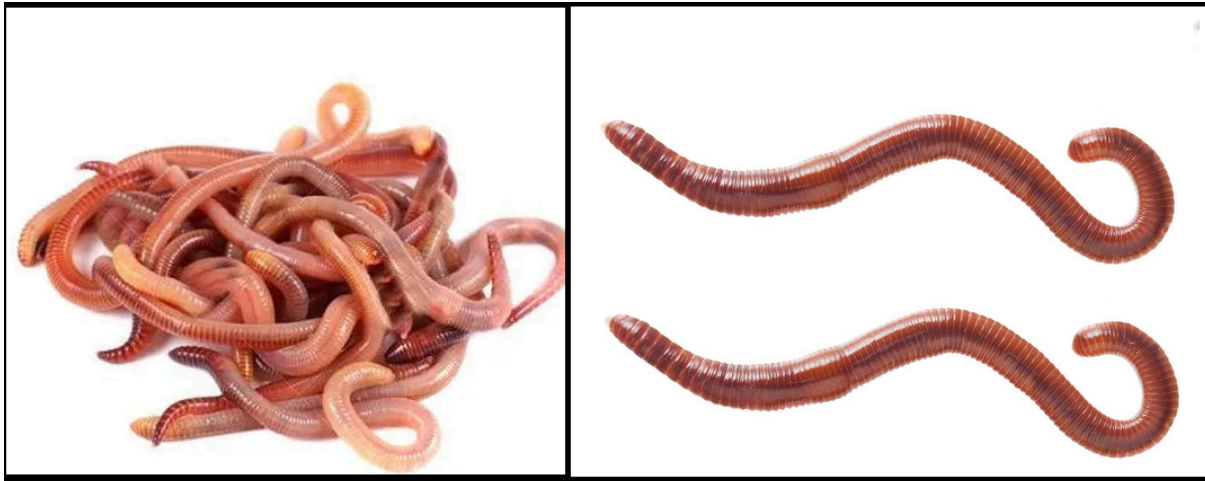
Figure 7. Earthworms, a) Eudrilus eugeniae , b) Eisenia fetida

has poor temperature tolerance, hence, may be suitably used in the areas with less fluctuation of temperature (tropical areas).